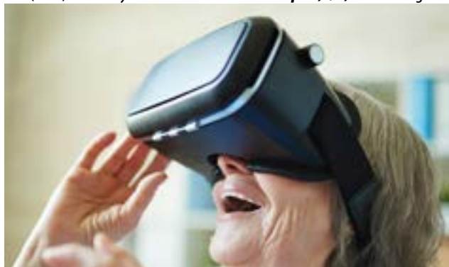
MCF grants included funding for a Virtual Realty for hospice patients.

• Home Health, $500: This is a grant from a Home Health family who designated their gift for a staff appreciation event. The staff held a paint and eat event at the Civic Center.