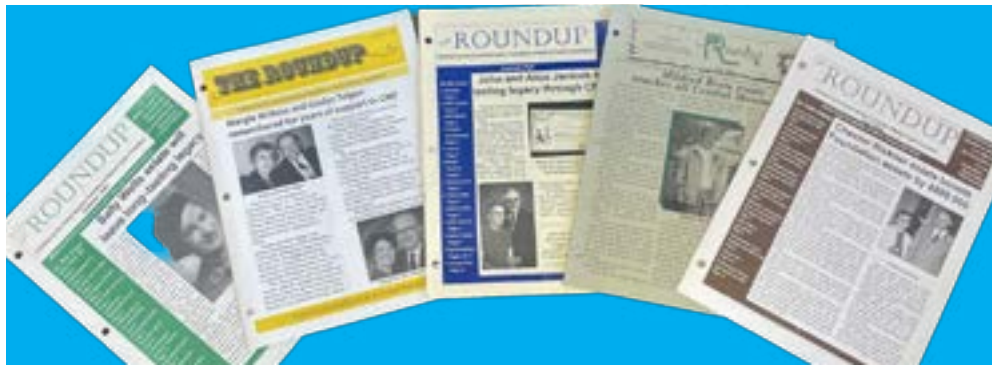
Central Montana Foundation is able to award grants to local projects thanks to its Legacy Donors who gave unrestricted gifts through the years.