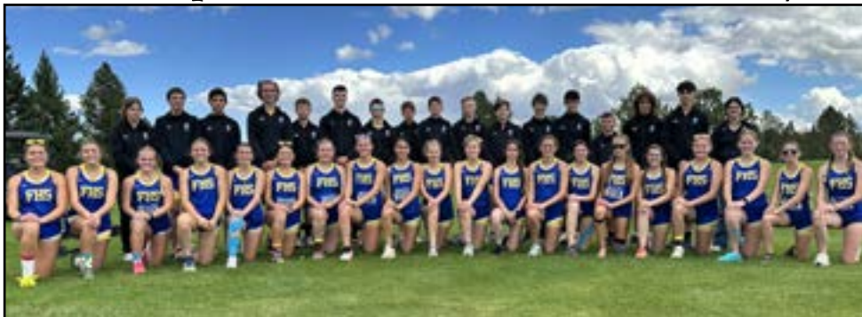
A new scholarship has been established for Fergus High School Cross Country runners.

"Cross country is a challenging sport that develops endurance