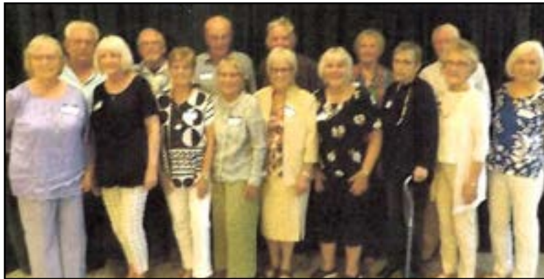
FHS and St. Leo's Class of 1959 held its 65th class reunion in August and have set up a scholarship fund for FHS graduates.

A spokesman for the class said they hope to build their permanent endowment and award an annual scholarship, "allowing the account to grow and increase the annual scholarship amount, long after members of our class have stopped