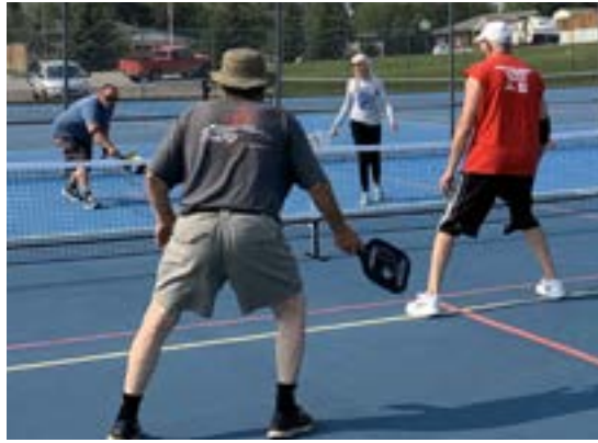
Lewistown pickleball players are looking forward to the new courts at Symmes Park.